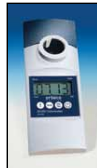
SC-400 Chlorine kit